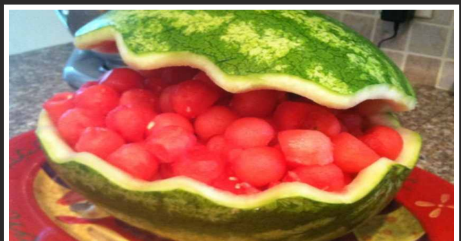
Various attractive shapes could be given to watermelon pulp.